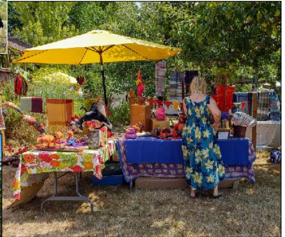
Community effort helped preserve the unique ecosystem of Brooks Point Regional Park.