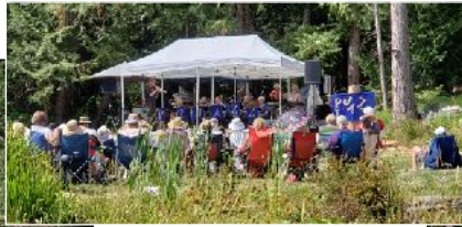
(Below) Penderites love their Saturday Farmer's Market and varied arts events.

Be it parade or concert, you're either part of the talent or the audience!