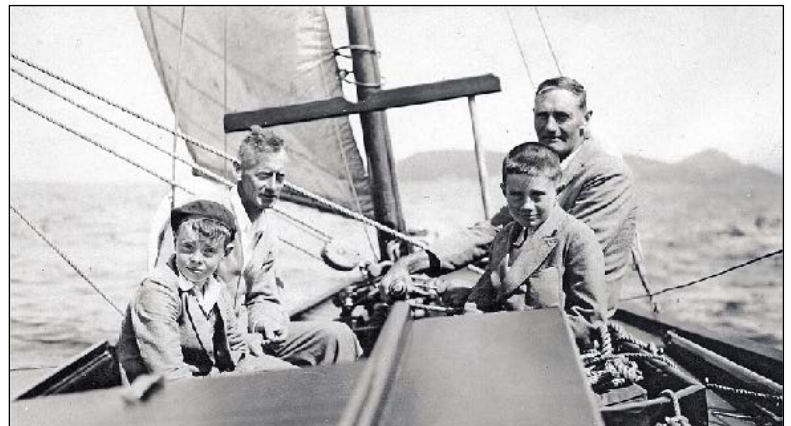
Just imagine! The man (left) born in a rowboat in 1889 en route to the only nearby midwife on Mayne Island lived to attend the 1981 opening of the Pender Islands Health Centre.